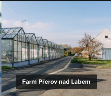
Farm Přerov nad Labem